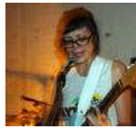
CMJ, So Far